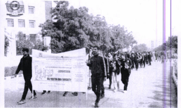
Collage covering the images of the Youth Rally